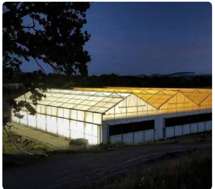
ThermaGlas Opaque panels are being used to full advantage, providing maximum reflection of indoor lighting at night. Note the opacity of the panels at front.