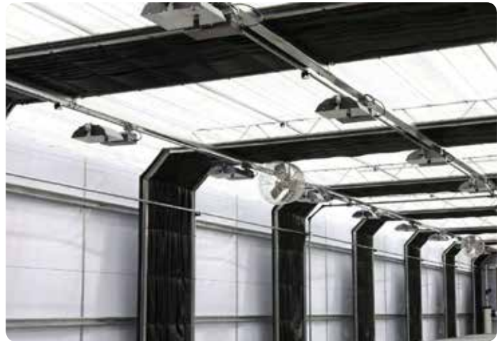
Here ThermaGlas Opaque panels are used as a highly reflective interior sidewall.

ThermaGlas Opaque features a 10 year warranty against gain of light transmission, and damage due to hail impact (see warranty for details).